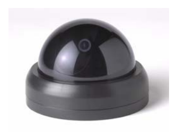
COLOR DOME CAMERA